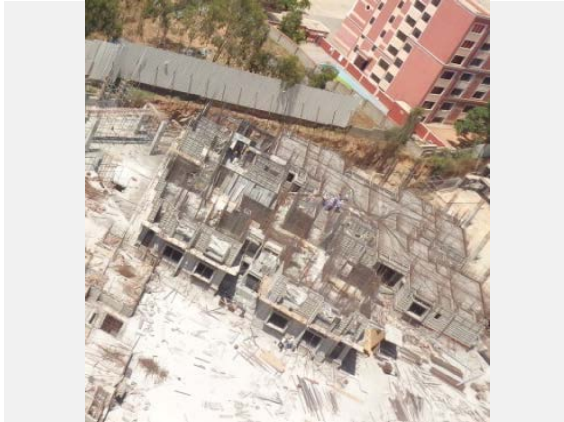
TOWER H Level 1 Work In Progress