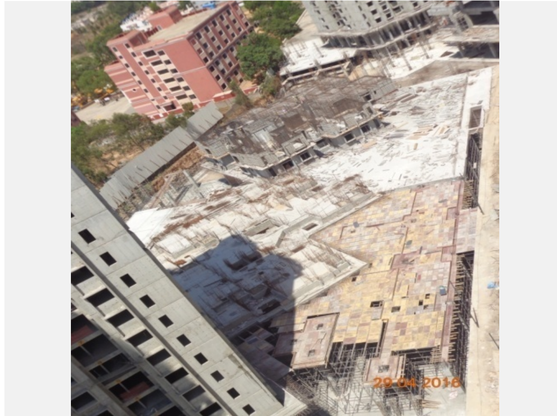
TOWER J Level 2 Work In Progress